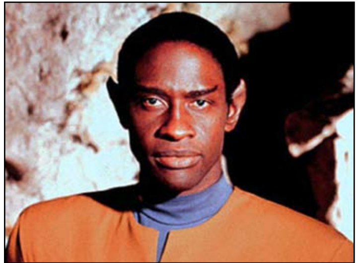
Tim Russ in full Vulcan makeup portrays Lt. Tuvok of the Star Trek Voyager, a series that expanded seven years. An Air Force dependent for 18 years, Russ also attended DoDDS-Europe's Izmir American High School in Turkey.

For seven years Russ portrayed Lt. Tuvok, the Vulcan Security Officer and Chief Tactical Officer for the Voyager . He has gone on to direct a Star Trek sequel, has recorded several music albums and has ap-